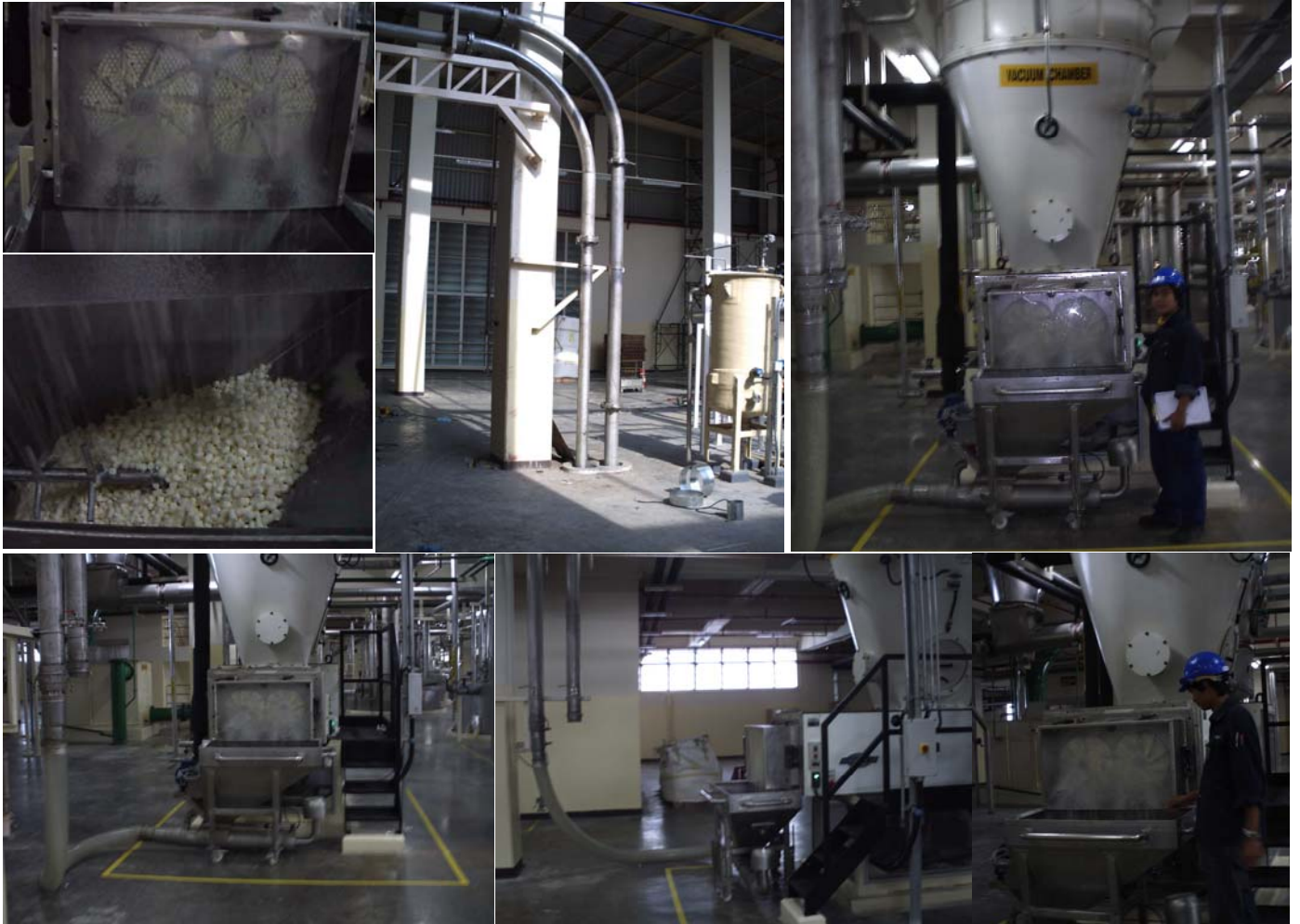
Dumping Hopper ,Ejector , Flexible hose, and Quick coupling from Extruder