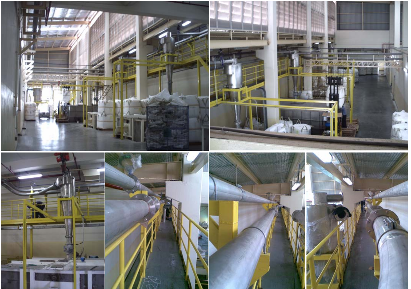
Loading Cyclone and Piping