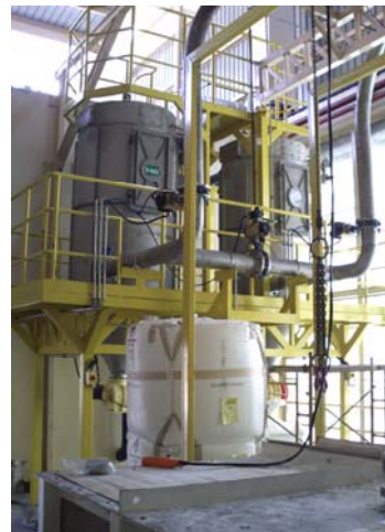
Jet Pulse Self Cleaning Bag Filter